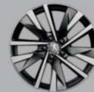
18" SPÉRONE diamond cut two tone