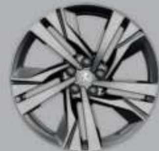
19" AUGUSTA diamond cut two tone