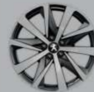
18" HIRONE diamond cut two tone