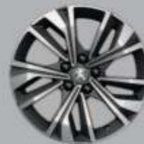
17" MERION diamond cut two tone